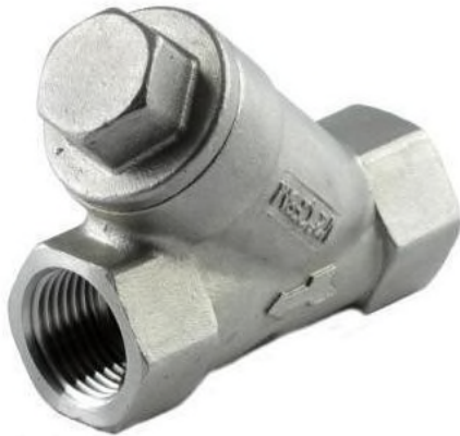
FIGURE NO. VCPY-S40P

316 SS CHECK VALVES, Y PATTERN, SOFT SEAT